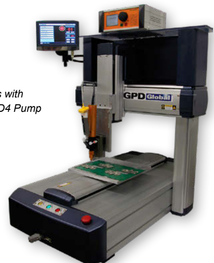
Island 3S4 Series with GPD Global® PCD4 Pump and Controller

The Island Series is designed to be an accurate, reliable platform for complex-to-simple dispensing tasks. Each system is built to last with its high quality materials and can be easily adapted to other applications or dispense pumps.