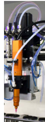
Volumetric Pump (option)