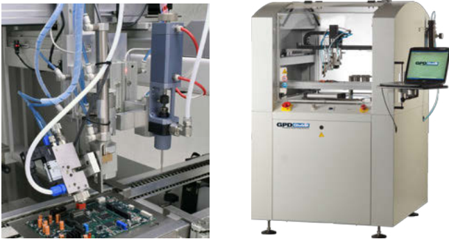
Tilt and Rotate Spray Valve

Both models are equipped with a robust 3-axis motion platform that, in the base configuration, includes a spray valve and a needle valve. An optional volumetric pump may be used in place of the needle valve.