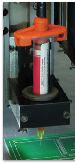
Time Pressure with 10 cc Syringe

The amount of pressure is automatically controlled through the software. The amount of pressure is determined by a relationship between the material being dispensed and the application flow rate. When dispensing is finished, an adjustable vacuum is applied to the syringe that prevents material from dripping. The vacuum is adjustable to avoid pulling air into the needle.