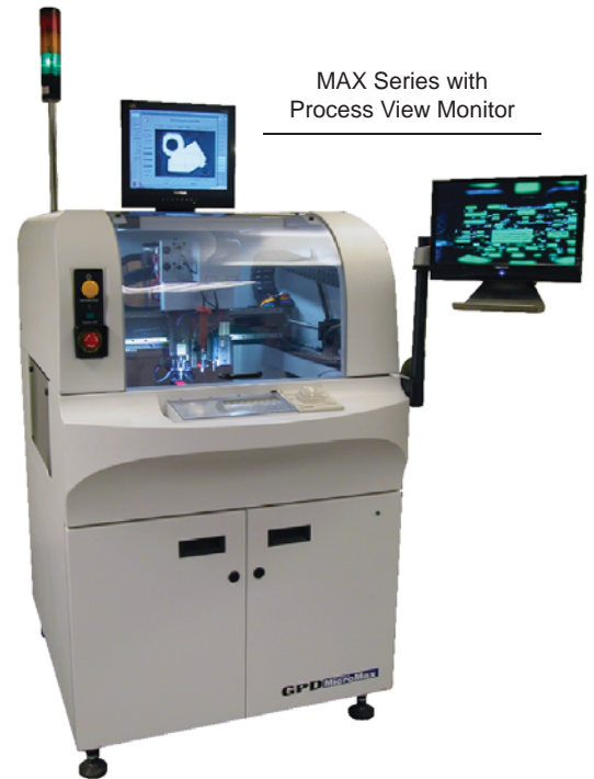
MAX Series with Process View Monitor

When used with DS Series systems, all three dispense stations can be viewed through the toggling camera.