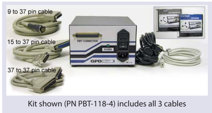
Kit shown (PN PBT-118-4) includes all 3 cables

Upgrading is simple. Just plug in the hardware to your PBFT, computer, and power source as shown below and install the software following instructions included in the PBFT VS SPC User Guide .