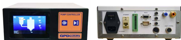
Figure 2: Front and Rear View of Programmable Controller

Pump Parameters available to the operator are acceleration, deceleration, speed, and in the case of dots, an exact amount of rotation. The touch screen interface is intuitive and is programmed for universal recognition with symbols and numbers. The programmable controller can also be connected to a computer for remote programming, making this a comprehensive controller for all Precision Auger pump needs. The operator may set up separate program profiles that can be referenced by inputs from your system. Figure 3 illustrates how an Auger pump integrates into a third party dispensing system.