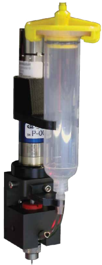
Precision Auger Pump

Upgrade your existing dispense robot with an advanced Precision Auger Pump. The Precision Auger Pump provides excellent dispense control and repeatability and is suitable for a wide range of applications and fluids.