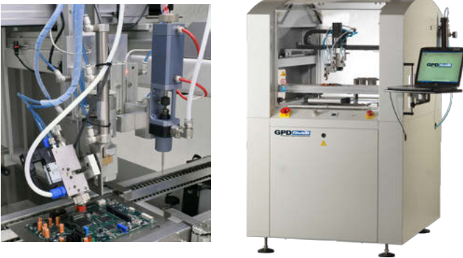
Tilt and Rotate Spray Valve

Both models are equipped with a robust 3-axis motion platform that, in the base configuration, includes a spray valve and a needle valve. An optional volumetric pump may be used in place of the needle valve.